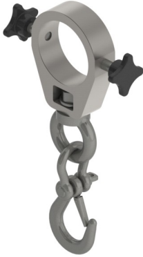
Collar and Rotating Hook

The collar fits to the Single Arm tool FA1110